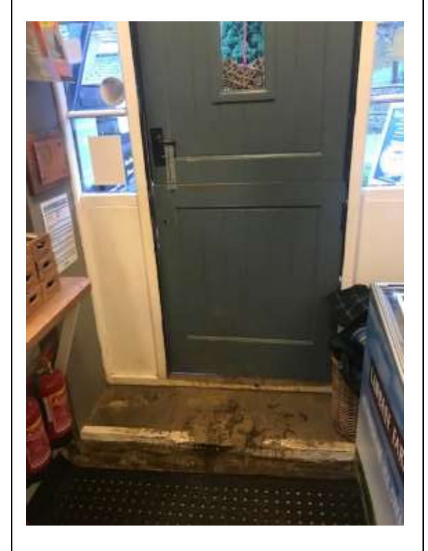
Main Entrance Area and Counter Area: