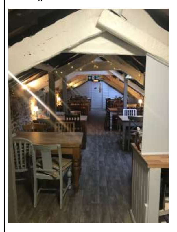
The Long Room: