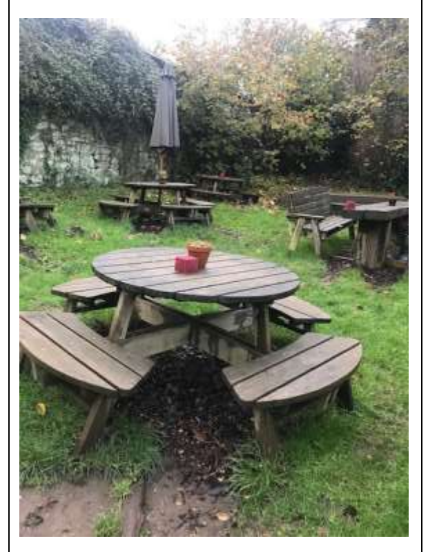
Dog Friendly Area: