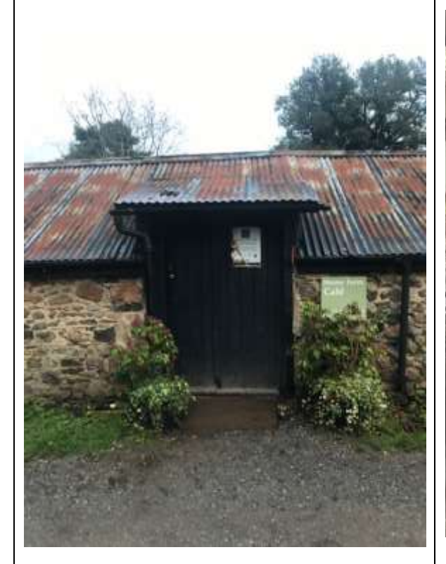
Long Room Entrance: